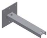
WALL MOUNT SLIPFITTER